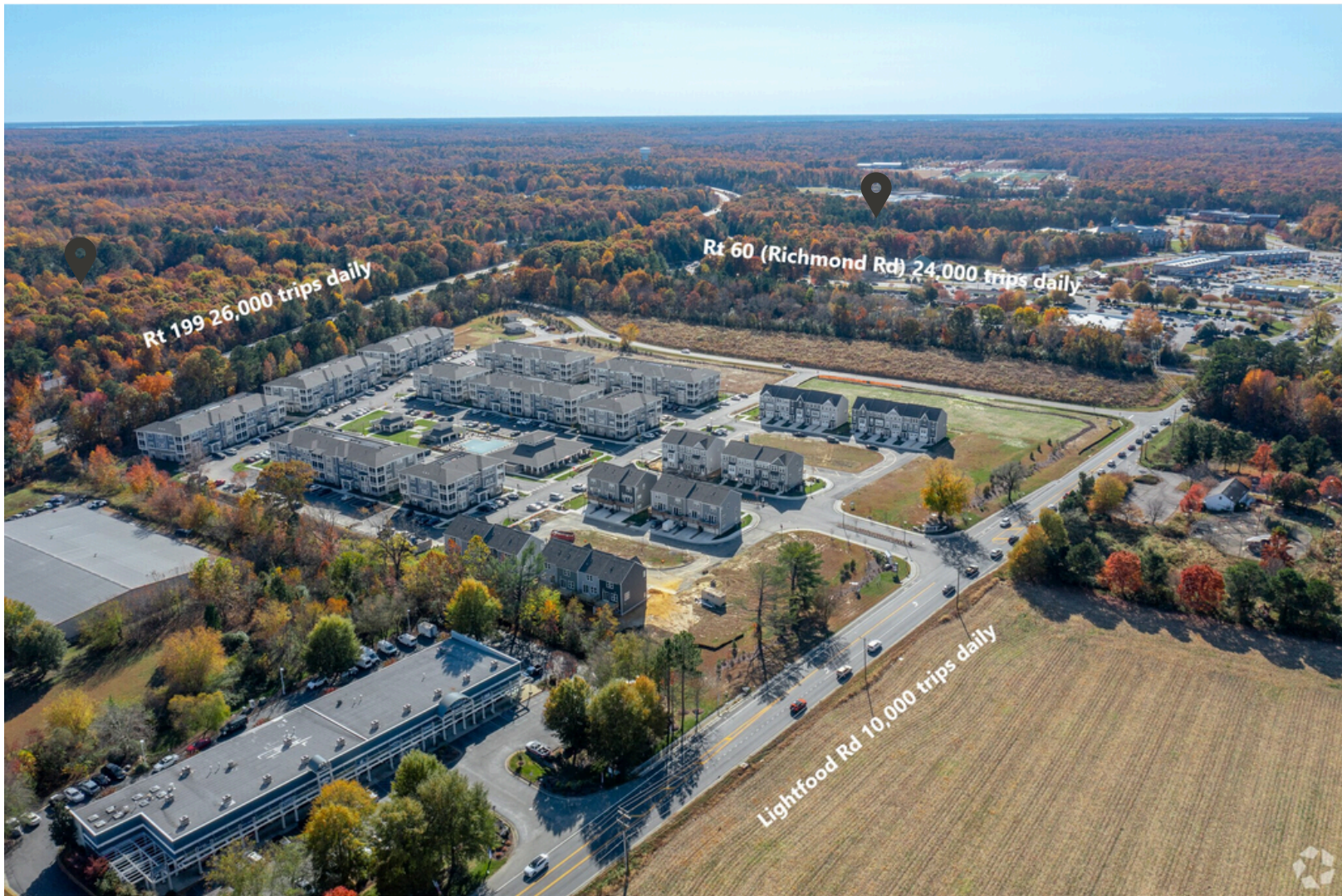
Major crossroads location with direct interstate access